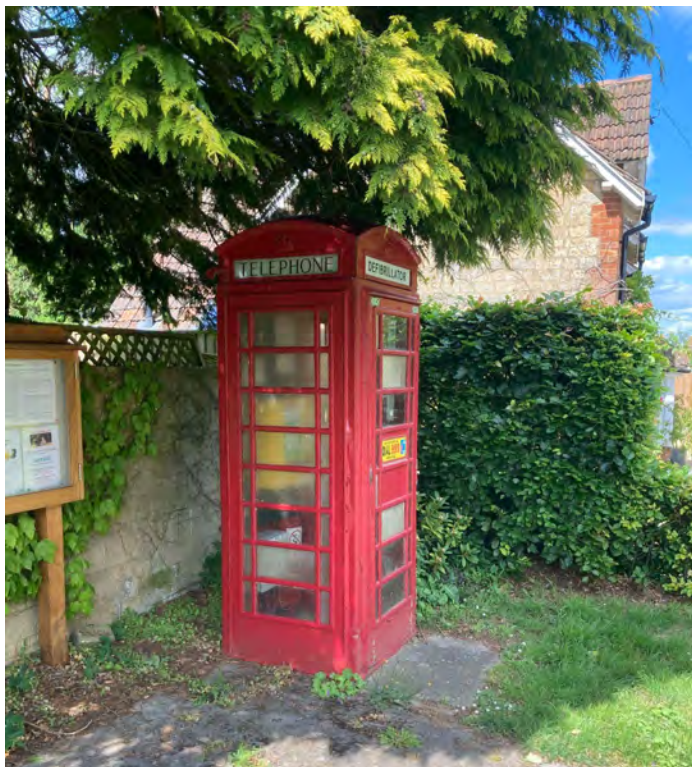
Description: Red Telephone Box